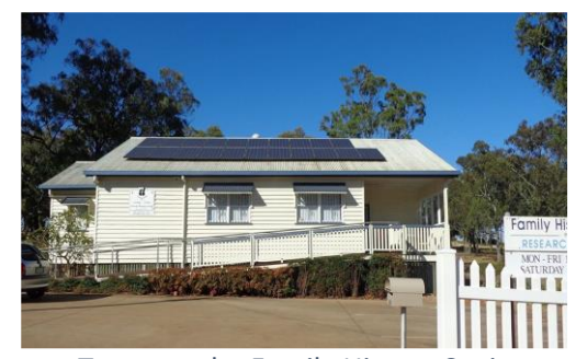
Toowoomba Family History Society