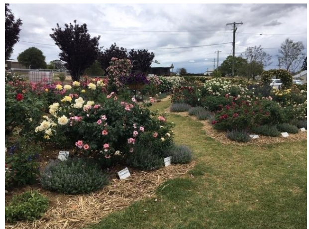
below A snapshot of her garden both looking over the Killarney valley.