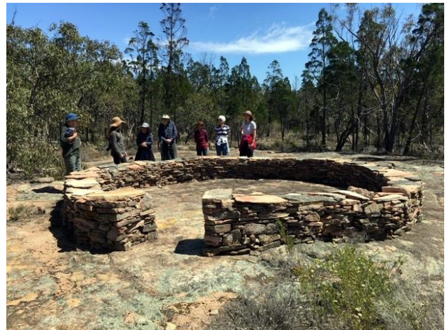
The meeting circle created by Esme

Next U3A Garden Group outing on Wednesday 21 st October will be a visit to Annette Russell's rose garden at "Montview" Killarney, more information to follow.