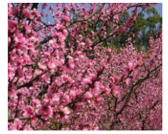
The beauty of spring!