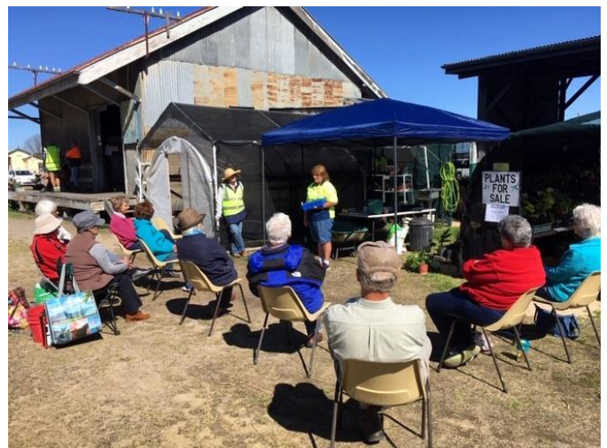
Garden group enjoying the session at the Whistle Stop garden

We will meet at Weeroona Park at 9.30 am to travel out together.