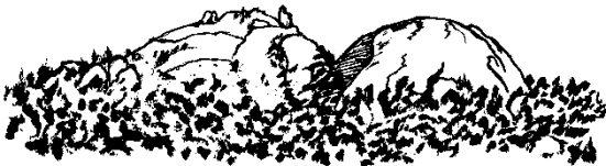
The Pyramids, Girraween National Park

Meetings: 4th Wednesday of each month at Uniting Church, Small Hall, 113 High Street Stanthorpe at 7.30pm