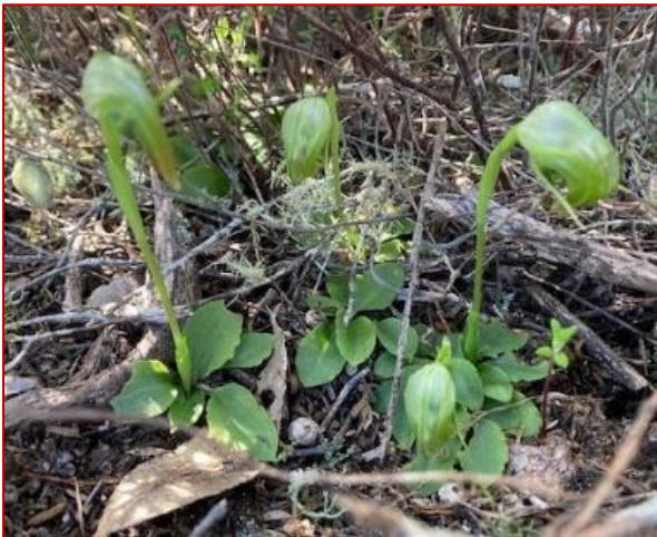
Nodding Greenhood Orchids