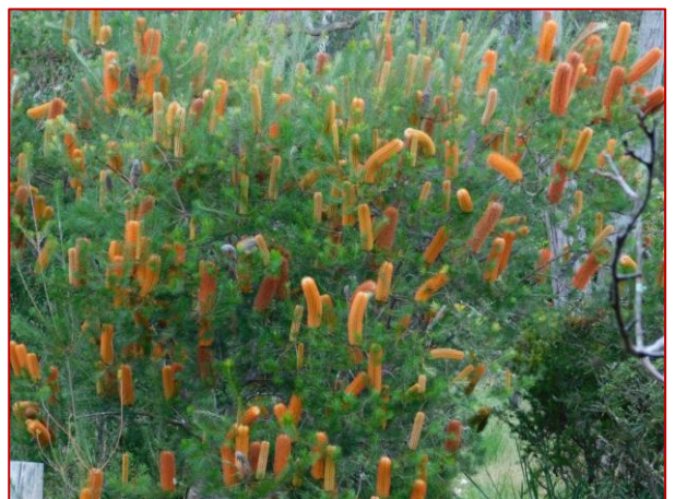
Banksia Giant Candles