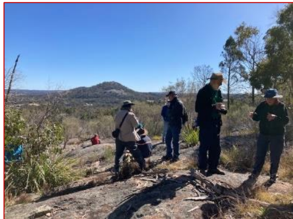
Smoko with Blue Mtn in background