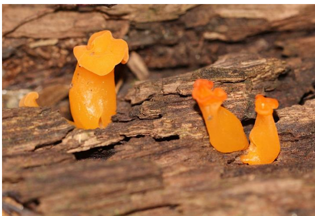
Fan-shaped Jelly Fungus Dacryopinax spathularia