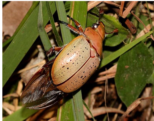
Christmas Beetle Genus Anoplognathus