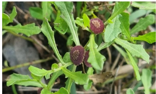
Spreading Nut-Heads Sphaeromorphaea australis