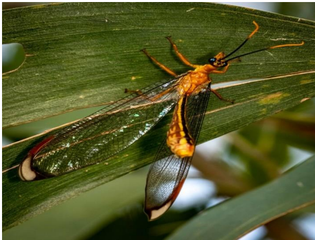
Blue-eyed Lacewing Nymphes myrmeleonoides