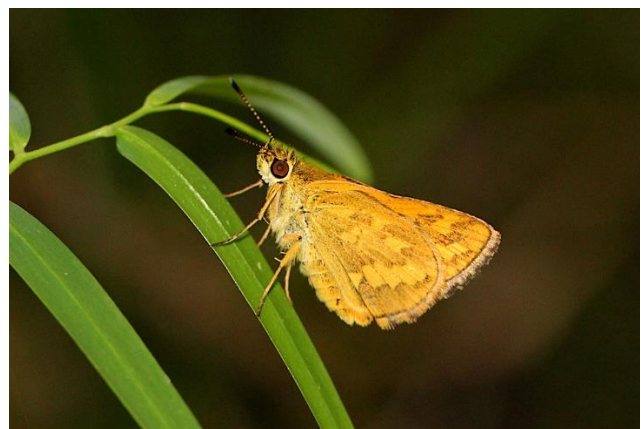
Grass Darts and Darters