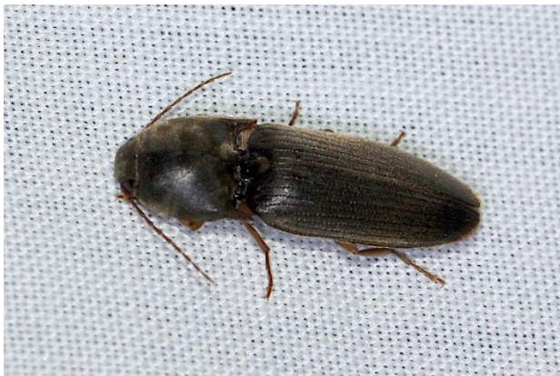
Click Beetle Family Elateridae