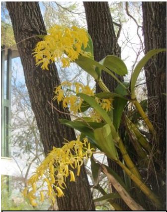
Golden King Orchid

Five members settled in at the Crows Nest Caravan Park for the campout with a further two staying in Hampton.