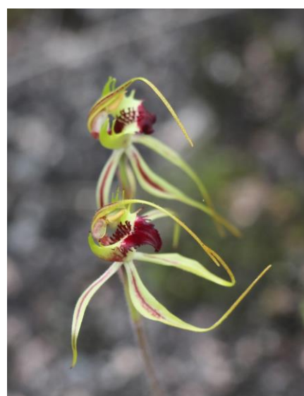
Caladenia sp. (Spider Orchid)