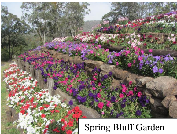
Spring Bluff Garden

Saturday morning we set off for Hampton to pick up two members there, then travelled via Collingwood and Fifteen Mile Roads to White Mountain Road and followed this for some distance. We stopped for smoko at a creek crossing and spent some time here with several plants in flower and interesting rock formations to look at. When we arrived at the junction of what we thought was a road we intended to use, it proved to be an overgrown bush track. We decided not to push our luck and turned around back to Fifteen Mile Road which we followed to Murphys Creek. We had lunch at the Community Centre grounds after visiting Historic Jessies Cottage, a small cottage built by an early pioneer.