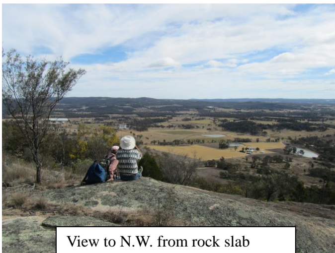
View to N.W. from rock slab

From our next vantage point on top of some large boulders we could see Mt Jibbinbar, The Brothers, Mt Lofty and Roberts Range. A Parsonsia (milk vine) was growing on one of the rocks and a Clematis across the "track" we followed to get there.