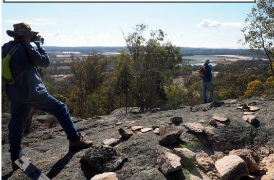
Granite flags & view from Blue Mt.

The outing attracted seven people on a fresh clear morning after the fog rolled away. A little after 9.30am we drove the 5km to the property on Aerodrome Road and enjoyed morning tea on a picnic table beside the dam, before setting off up to the summit of Blue Mountain.