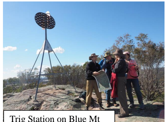
Trig Station on Blue Mt

scrub gave way to granite flags and interesting tors with the predominant vegetation of tea tree and tall trigger plant, Stylidium laricifolium , with a few in flower, and Wallangarra wattle Acacia adunca , just starting to flower. Cattle graze on the slopes and feral goats live on the rocky mountain top so evidently, the trigger plants are not palatable. There were several gnamma holes still full of water since the last rain and a couple of Fig trees