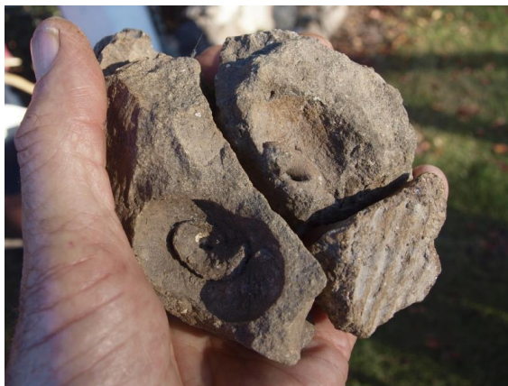
Fossils found near shearing shed

couple of shortcuts reached them by about 1.30pm. After lunch we returned to the homestead where Cathy took us to the hill nearby which gives the property its name. A short scramble took us to the top of a very rocky ridge and further along to the west we descended to some small caves in the cliff face. Here we could see the white deposits of alum which were being dissolved out of the rock along the cracks.