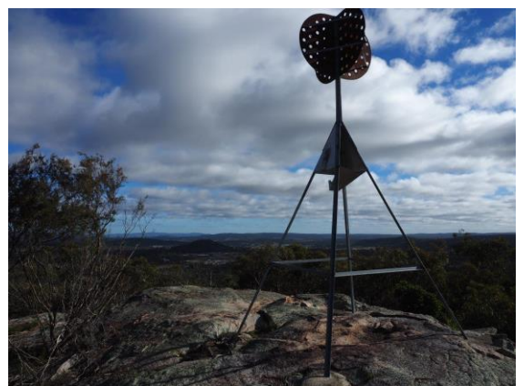
Trig Station Blue Mountain

Blue Mountain is the first granite topped mountain you see to the north as you head east from Stanthorpe on Amosfield Road. We will access it from private property on its northern side, off Aerodrome Road. The walk to the top is steep but not far and there are good views over town and surrounding farms etc. We will return to the cars on a more gentle route and have lunch there, or head home if you prefer.