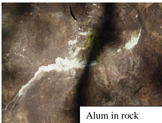
Alum in rock

"The Pikedale floodgate was constructed in 1923 by a man called Burns and a team of draught horses. I presume the cost was shared between the owners of Pikedale, the Rogersons and my great grandfather Gordon Smith. It was quite a feat when one observes the size of the posts and wire cable used and the inaccessible terrain. Unfortunately the floodgate turned out to be a bit of a failure as successive floods twisted the gates and wire etc. It still serves some purpose but needs attention after every bigger flood and when water dries up. The year 1923 is written in the concrete on the left hand side."