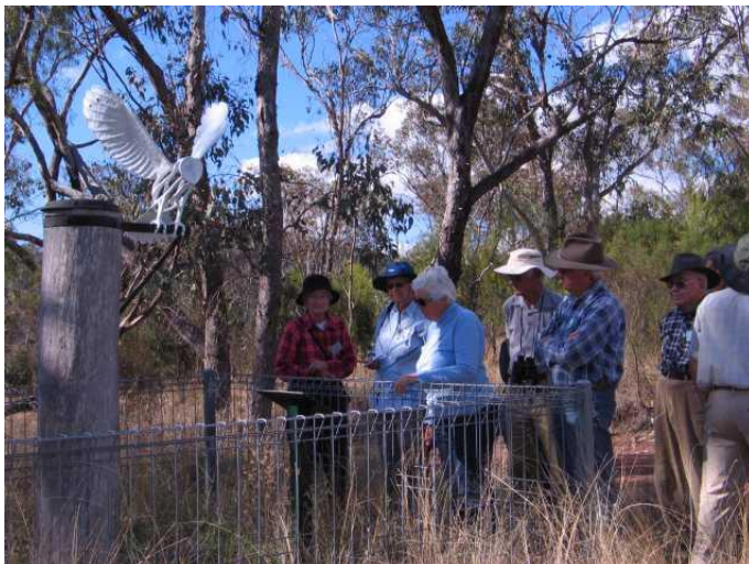
Field Nats members read the plaque at the Ghost Gate monument

After lunch we enjoyed the view of the full extent of Allora Mtn, from a slope south of Goomburra Road, approximately 10 km. distant. We also could clearly make out the high hills of Leyburn State Forest on the western horizon. We proceeded to the Ghost Gate Owl monument on a nearby saddle. In the old days the stockmen were often spooked at night when the gate would open, seemingly of its own accord. It turned out that the reason was that when the owl sitting on the gate flew off, the delicately balanced gate was given the slightest push from the owl as it took off.