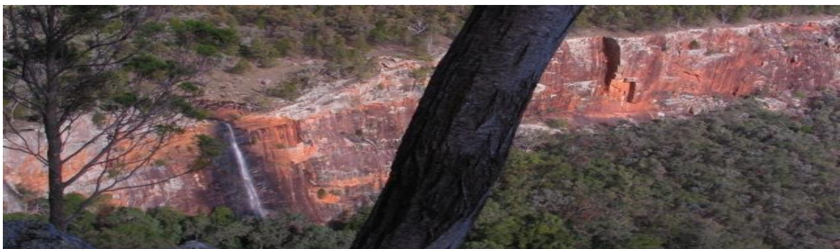
I took this picture of a tree trunk and later noticed this impressive cliff in the background, complete with waterfall!

This contact can also be used if you want to change your current email address.