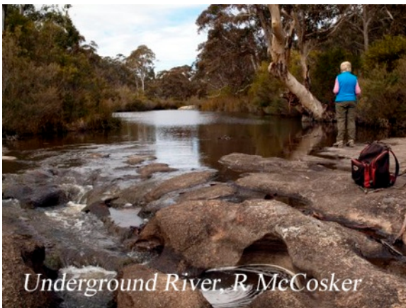
Underground River.

Nine members met up at the Dr Roberts Waterhole Carpark to be greeted with brilliant displays of Acacia adunca and Snowbush, Leucopogon melaleucoides , which made up for the cool dull weather. We had our cuppa then set off down the track with Coral Heath, Epacris microphylla providing the trackside interest until we branched off towards the Underground Creek and dense stands of New England Banksia, Banksia spinulosa var. neoanglica , became dominant. Several Eastern Spinebills also put on a show for us, flitting from bush to bush, and as we neared the creek there were