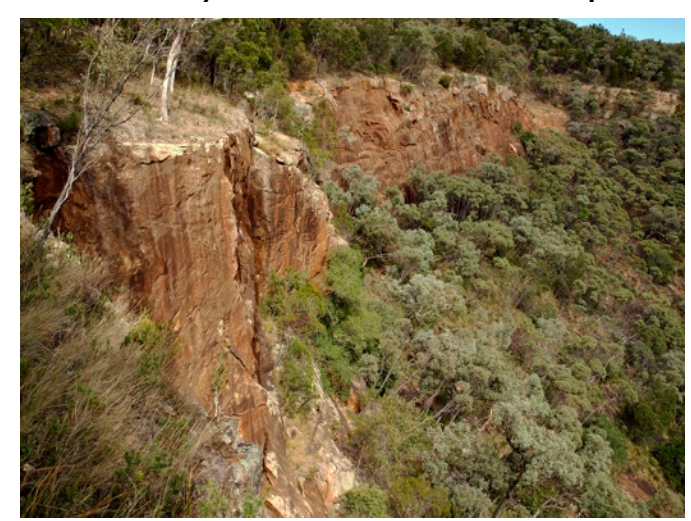
Monthly Newsletter of the Stanthorpe Field Naturalist Club Inc. May 2012 - Vol 438