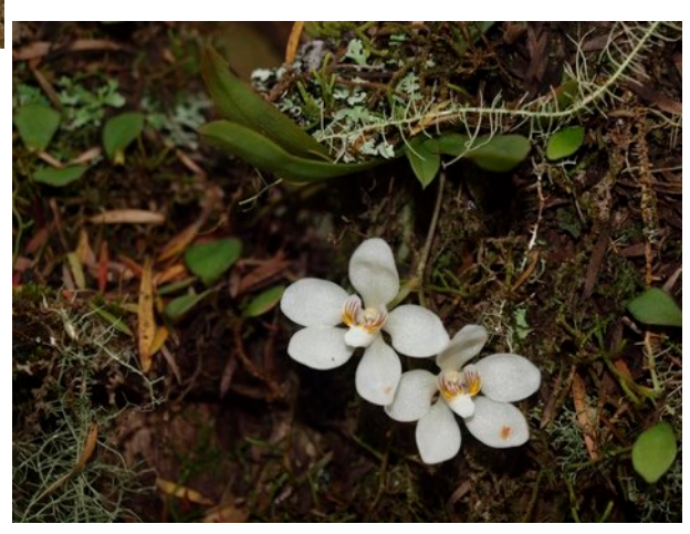
Orange blossom orchid - Sarcochilus falcatus

Plectranthus graveolens, Solanum, Dianella, Bulbine Lily – Bulbine bulbosa, Orange blossom orchid - Sarcochilus