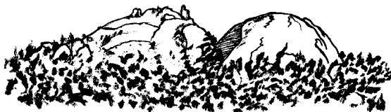
The Pyramids, Girraween National Park

NOTE; the latest status of any outing is posted to the FieldNats web site as soon as possible.