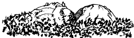
The Pyramids, Girraween National Park

Management Committee: President, Vice-Presidents, Secretary, Treasurer.