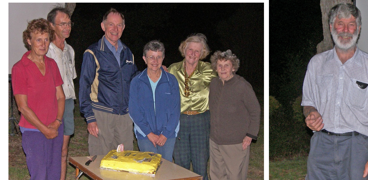
Founder members to cut the cake!