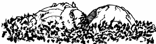
The Pyramids Girraween National Park

The Club acknowledges the support of the Gambling Community Benefit Fund in the production of this Newsletter and the purchase of a data projector