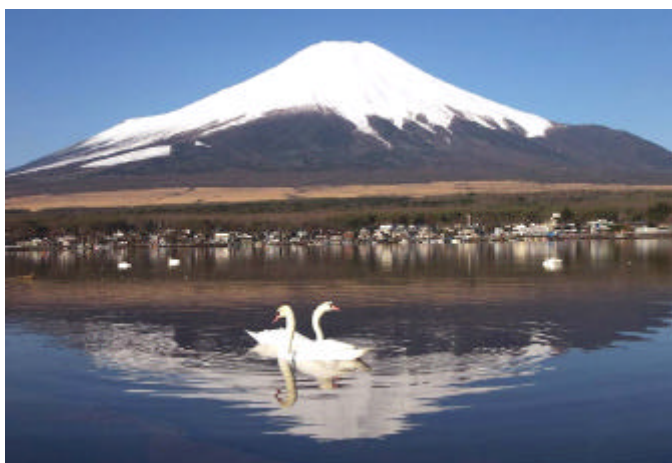
Mt Fuji by Errol Walker

Break-up: Sunday 9 th December: Dilga Mt Tully Road