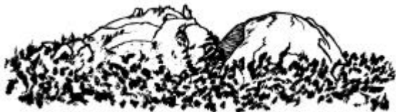
The Pyramids, Girraween National Park

The Club acknowledges the support of the Gambling Community Benefit Fund in the production of this Newsletter and the purchase of a data projector.