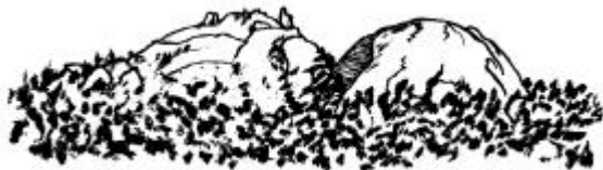
The Pyramids, Girraween National Park

The Club acknowledges the support of the Gambling Community Benefit Fund in the production of this Newsletter and the purchase of a data projector.