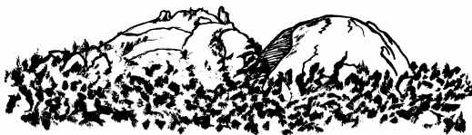
The Pyramids, Girraween National Park

The Club acknowledges the support of the Gambling Community Benefit Fund in the production of this Newsletter