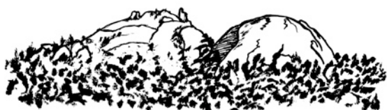
The Pyramids, Girraween National Park

The Club acknowledges the support of the Gambling Community Benefit Fund in the production of this Newsletter