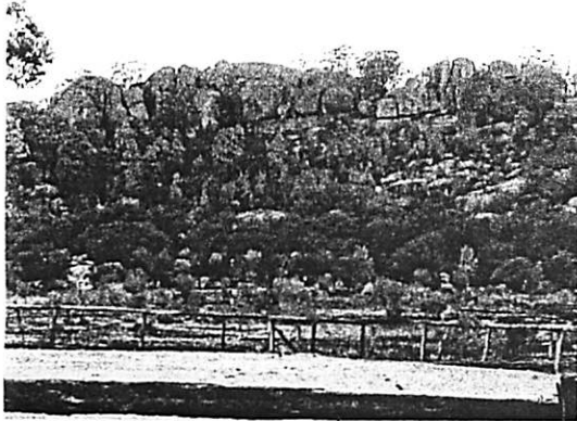
Rocky Hill at Eukey 27 th October 2002

Most of the following photos were taken on Sunday 27 th October during light rain. The fire started on Thursday 17 th October. The rain should help with regeneration if we get some follow-up soon. There is grass sprouting near the creek at "Orana".