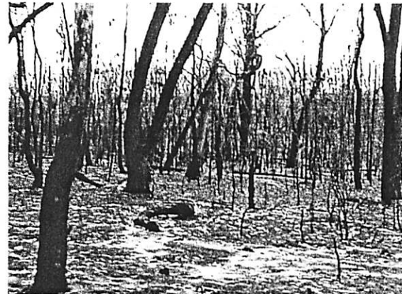
Fletcher Hill 27 th October 2002