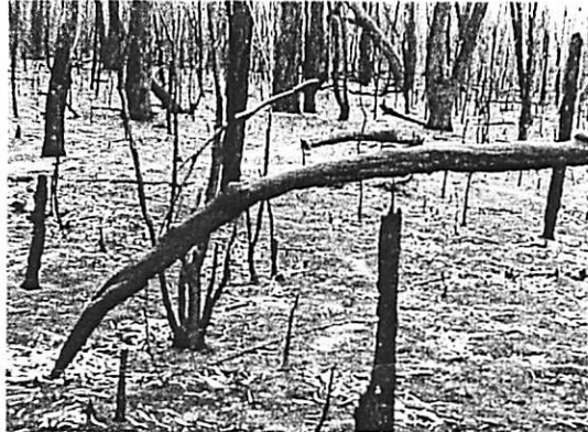
Fletcher Hill after fire during rain