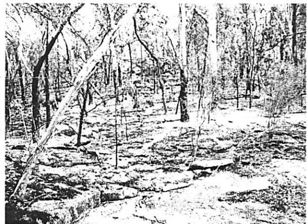
Fire damage at "Orana"