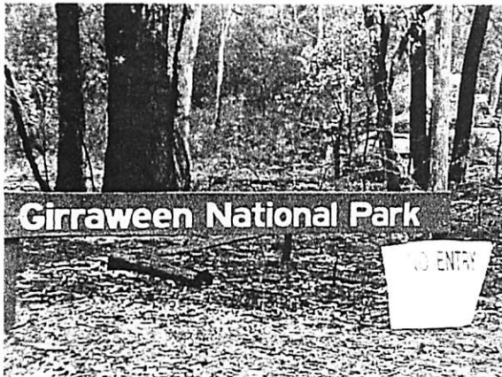
Closed because of fire