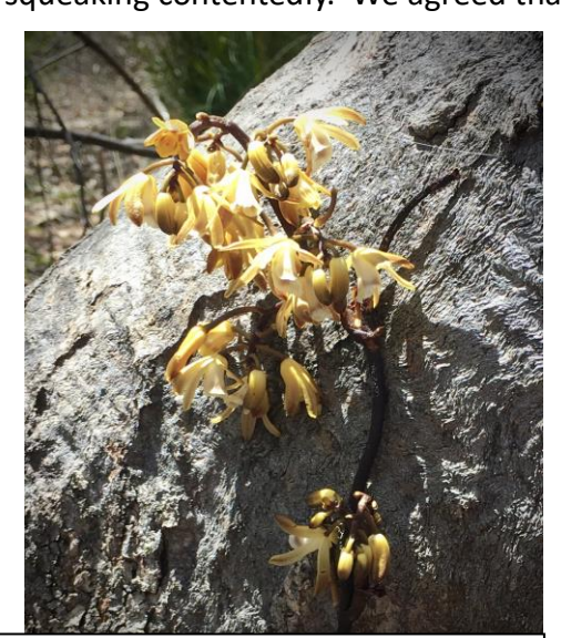
Erythrorchis cassythoides – H. Patti

us to see how high we actually were, before continuing downhill all the way down to the creek at the bottom. We passed a heathy area filled with lovely lemon coloured Alpine bottle brush. Unfortunately, the recent rains had not filled the waterholes as much as I was hoping but it was still a beautiful spot to sit for lunch and do a bit of birdwatching. The frogs sounded to be plentiful and were squeaking contentedly. We agreed that it would be a great birdwatching spot in the early morning or