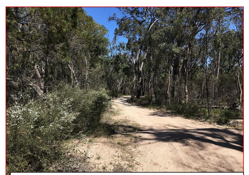
Walking Track Broadwater State Forest.

We will meet at Weeroona Park at 9 am and carpool as there is limited parking at the start of the walk. We will travel north on the highway and turn left into Ellwood Road following it almost to the end where the State Forest begins.