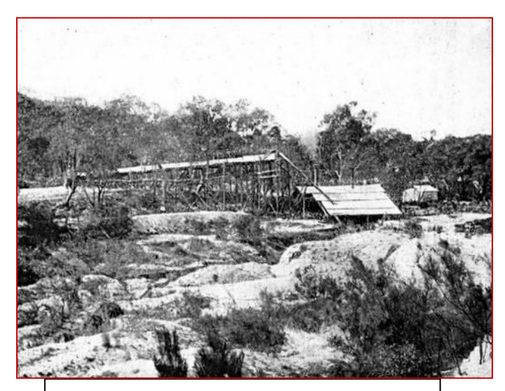
Dredging Claim of Stanthorpe Tin Ltd. Stanthorpe Tin Limited, Portable Dredge, Blue Mountain Gully, Blue Mountain