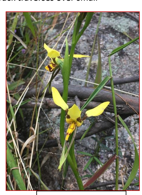
Diuris sulphurea.

Unless there has been rain the road may be a bit dusty and slippery in some places and you may like to bring along hiking poles. At the bottom of the walk is a lovely waterhole. It has been getting lower and lower each time I have been, but hopefully we will have some rain before the walk. On the pre outing walk the kunzea in this spot was absolutely wonderful, along with the wax lip orchids and paper daisies. I also came along a black snake which was not as wonderful. It is bushy along the creek but there are lots of spots to find on the edge for lunch. The walk up from the creek is predominantly uphill all the way but is a very gentle slope and quite pleasant. The walk passes through several different types of countryside and hopefully we will see some lovely wildflowers.