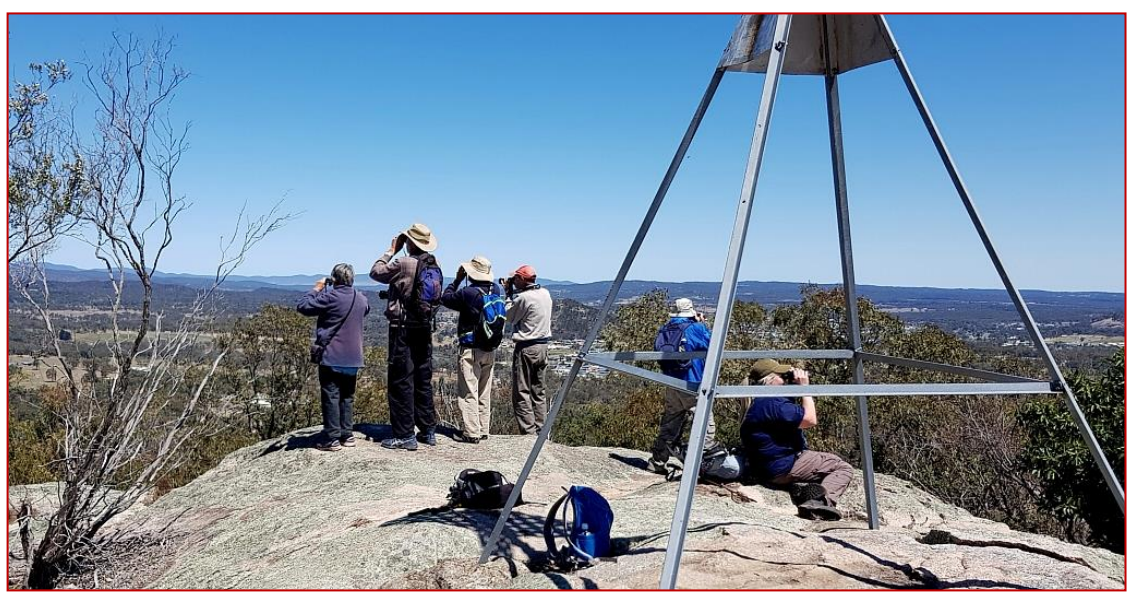
Outing report - Blue Mountain, McCosker's - 27<sup>th</sup> September 2020

14 members met at McCosker's 335 Amosfield Road. After morning tea we started the arduous climb to the top of Blue Mountain. Walking through timbered section to the base of the rock pavement on the southern side of the mountain, the first part was fairly steep but once on the rock it was easy going.