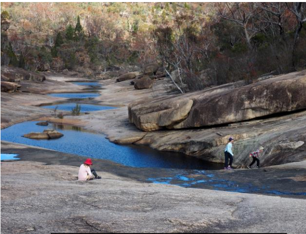
The Junction in wetter times

Deadline for next newsletter 9 th August 2019