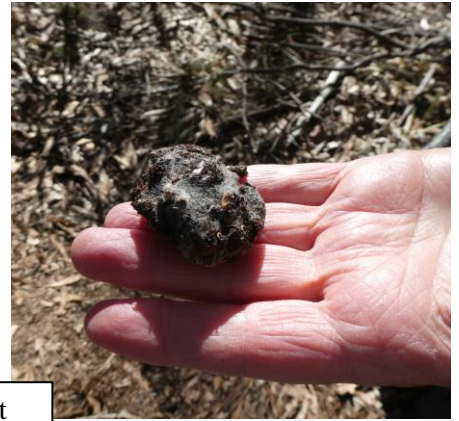
Regurgitated Owl? Pellet

The first part of the track was up a dry watercourse till we arrived at the track proper. We admired a number of fig trees and clumps of tongue orchids growing on some of the large boulders beside the track. The roots of one fig were starting to make a curtain from the rock to the ground. As we headed uphill we noticed an area with bird droppings and pellets right beside the track. The pellets had parts of insects and fur in them so we thought it might have been a roost for an owl or owls. They were not roosting there as we passed, so we can only guess. Kookaburras also regurgitate pellets containing bones and hair and I wondered if that was what was roosting there.