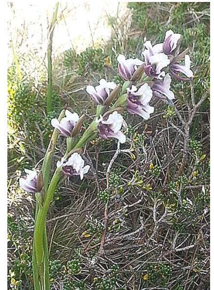
Photos above Pretty Valley trail & pondage, Sun-veined Orchid, Mauve Leak Orchid,