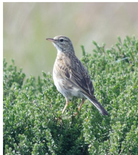
Australasian Pipit

Next walk was Mt Cope with the weather barely better, and the view at the trig – nil! But the Snow Gums in these conditions get those wet and wonderful colourings.