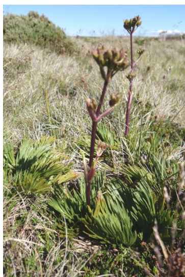
Photos: Clockwise from top: Huffing puffing to Cope Hut Pretty Valley is Aciphylla gracialis Snow Aciphyll or Mountain Celery Family Apiaceae

the top was forever. This is the highest point on the High Plain and the crystal clear air and cloudless sky gave views from Mt Hotham and beyond in the south to Mount Kosciuszko in the north. We passed through a field of Pipits, and almost back to the road we came across patches of a plant which I am not able to identify. Low growing and slightly whorled, in small patches about 10cm high, with leaves that looked and felt sharp like cycad leaves, we found some in bud and some with spent flowers. I might have crashed before dinner, but thank you Ana for the passionfruit/lemon gin sling!