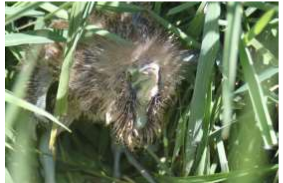
Chick in nest