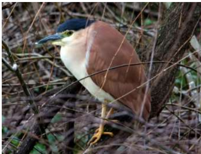
Photos taken at McCaughey Park, Yanco on 1 August – the lower picture is a juvenile.