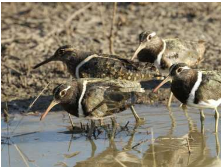
Painted Snipe