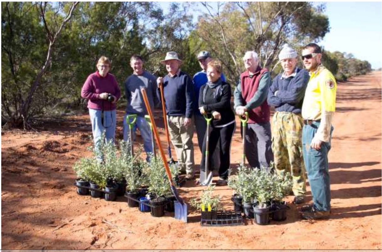
MFN Group at Round Hill Nature Reserve ready to plant the Grevillea illicifolia seedlings on 18 July

To facilitate and promote the knowledge of natural history, and to encourage the preservation and protection of the Australian natural environment, especially that of the Murrumbidgee River Valley