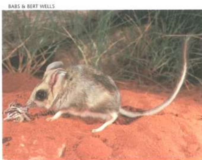
The Kultarr resembles a dunnart in most of its features, except its long, brush-tipped tail and very long hindlegs.