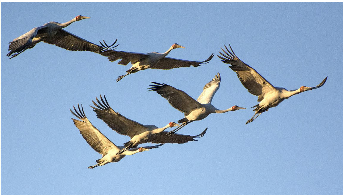
Brolgas at Tuckerbil Swamp in the late afternoon of 4 June

To facilitate and promote the knowledge of natural history, and to encourage the preservation and protection of the Australian natural environment, especially that of the Murrumbidgee River Valley