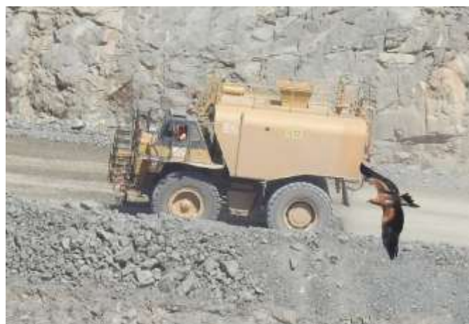
Members geared up for visiting the mine site Overlooking the mine pit with a Wedge-tailed Eagle soaring