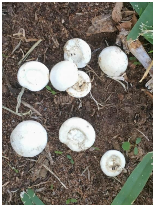
Ellené’s photo of her gastroliths