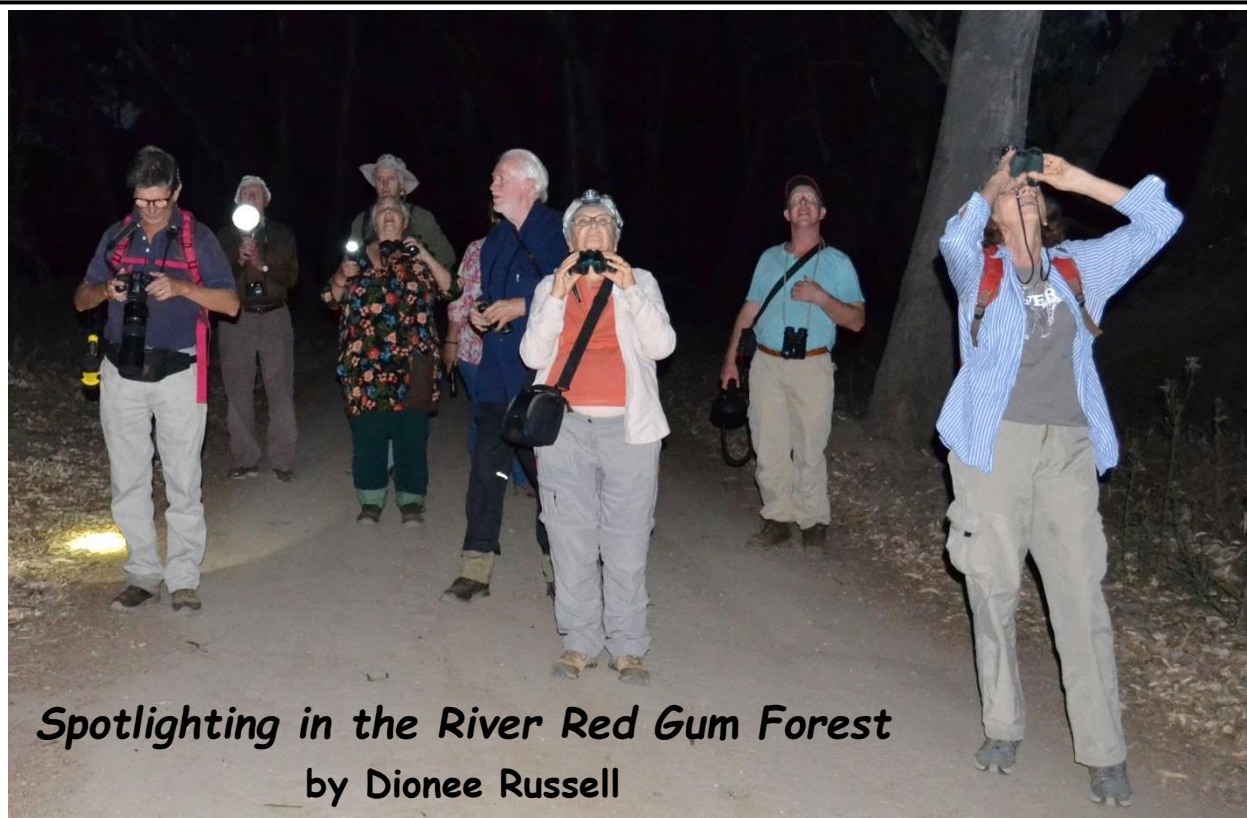
Spotlighting in the River Red Gum Forest by Dione Russell

To facilitate and promote the knowledge of natural history, and to encourage the preservation and protection of the Australian natural environment, especially that of the Murrumbidgee River Valley