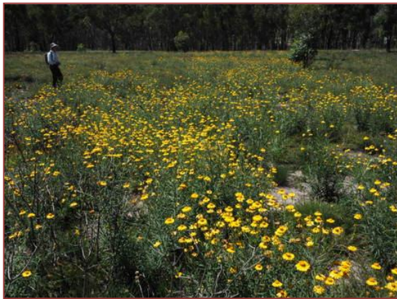
Everlastings on the Aztec Temple walk

“The green carab beetle ( Carabidae family) is a large ground beetle which can grow to around 27 millimetres in length. Both the larvae and adults feed on other insects and under favourable conditions can build up in large numbers. Adults are nocturnal and often attracted to lights at night. When disturbed they can produce a nasty smelling odour as a defence against attack. This species is active during the summer months and can be found hunting on the ground or on vegetation during the day. The larvae of this species is thought to dwell predominantly underground. The green carab beetle occurs over much of Australia and is often collected in pitfall traps”. Rob McCosker