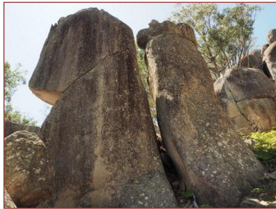
Rock Formations at Aztec Temple