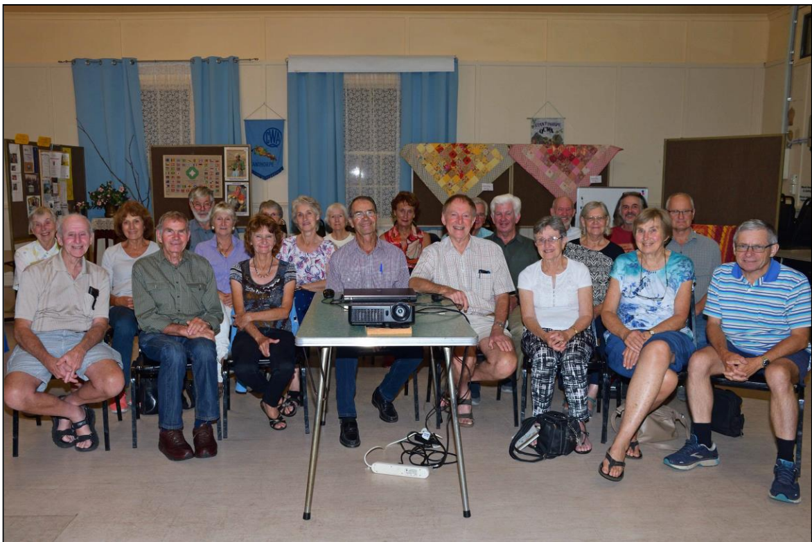
The Whole Crew at the Meeting