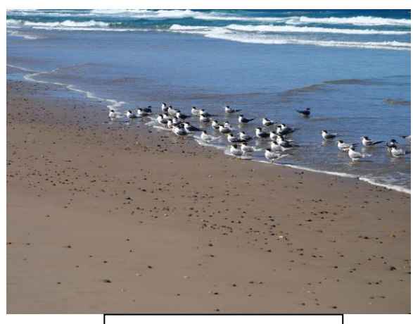
Terns on the beach

Six members attended the Black Rocks campout from Monday 2 to Friday 6 September. The weather was kind if a bit warm at times. On Tuesday we took the Jerusalem Creek track to the mouth lunching at remote campsite number 50 near the mouth, returning via the beach. We only had to coffee rock hop twice this time. Wednesday was decided on as a do it yourself day with some going on the Corvid Trail and others canoeing the creek. The evening meal was taken together at one of the campsites. We were joined by Peter's son down from Brisbane.