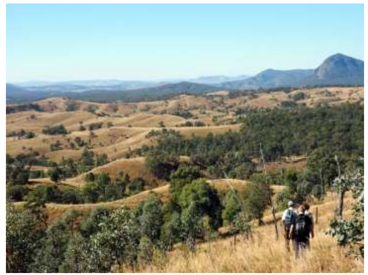
where we located the small hidden chasm.