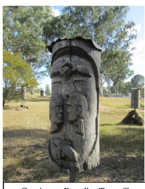
Carving at Bonalbo Turnoff

From Drake we go to Tabulum, on the Clarence River where we will look at the Light Horse Monument, before heading to the Bonalbo turnoff. There is a sculpture park at the turnoff dating from 1984, so we will have a look at the sculptures which are carved into wood. From here it is a very pleasant drive to Bonalbo, famous for bulls. We saw some magnificent specimens on the pre-outing. Not far along the road we passed McNamara's Plantation which has eucalypt and pine forest. We crossed over Knockmebandy Creek which has rainforest vegetation and saw a pheasant coucal crossing the road. There are a couple of places to stop in Bonalbo for a comfort stop before heading to Old Bonalbo a few kilometres down the road. There was beautiful autumn foliage when we did the pre-outing but it will have finished by the time we do the outing. Hopefully the weather will be as glorious as it was then. Bean Creek Falls is the next stop where the air was full of the calls of bell birds. There was a