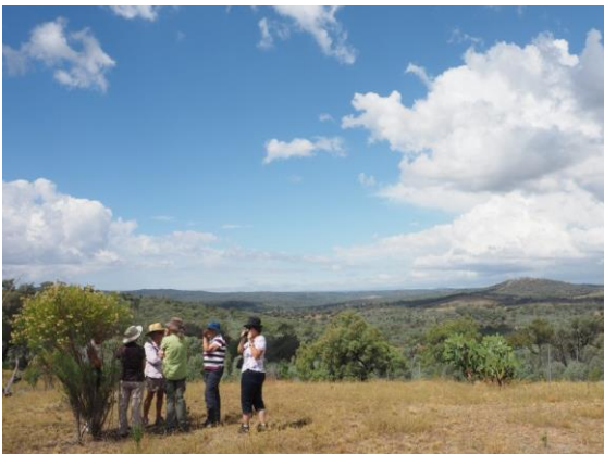
View to the East McIntyre SF

The area is typical of the region - ironbark/box/gum woodland with very little understory. Mostly just one or two wattles and dead finish. One stand of wattle took our attention. It was a very tall grey foliated tree similar to Brigalow and appearing typical of dry vine scrub species.