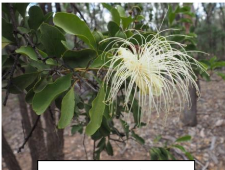
Caper Bush Flower

Thirteen members attended the outing on what turned out to be quite a warm day with broken cloud but, fortunately, no rain. The area had had sufficient rain to give it a green tinge but it was still very dry.