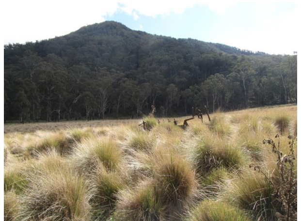
Old Plough in Grassland

There is an old plough in the open grassland plateau. Donald said that many years ago they tried to till the land to kill out the 'tufty grass', with no success. We then walked back through the Gorge, some took a slightly different route back to the cars via the creek and some stayed on the track. We were back at the cars around 3pm which left plenty of time to travel home before dark.