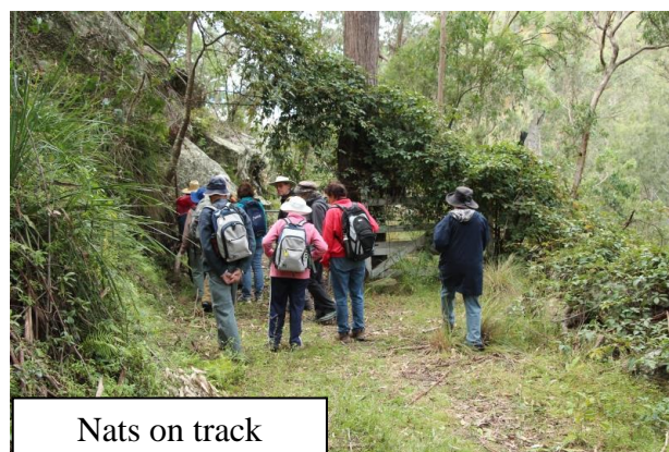
Nats on track

We proceeded to walk up the hell hole track. This was built by hand by Donald Learmonth using a compressor, jackhammer and 3000 sticks of gelignite in 1980-1982. Donald explained the reason they built the track was that it would take 8 good horsemen from sunup to sundown to muster the Gorge and the cattle were difficult to get out; they were born up there and they didn't want to be moved out of the valley. There was only a narrow bridle trail. Good horsemen were becoming scarce and they needed an easier way to get the cattle out of the Gorge. The Gorge is totally enclosed on all sides with cliffs on both sides. It is almost a perfect hideaway.