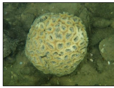
Brain Coral, Dipsastraea speciosa

Two companies operate water taxis from Toondah Harbour to North Stradbroke: North Stradbroke Island Water Taxi (Vehicle Ferry & Water Taxi) and Stradbroke Flyer Water Taxi (Gold Cat). The journey will take around 25 minutes. Timetables and vessels are subject to change without notice so check the day before departing. The last ferry from the island is at 19:25 or, if you require a bus connection to the train, at 18:25.