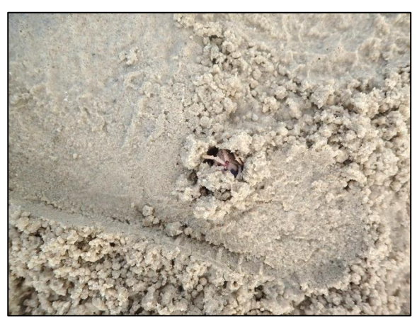
Soldier Crab, Mictyris longicarpus, spends much of its time buried underneath the sediment. Large numbers emerge on the falling tide to feed on detritus, leaving rounded pellets of discarded sand behind them.

Our day will start with a leisurely nature walk. The area around Dunwich offers an excellent opportunity for bird watching, especially shore birds; whereas in the cemetery, koalas can often be seen. After a lunch break, we will start to explore the low-tide area in the park in front of Bradbury's Beach. The low tide is at 16:17 (0.14 m).