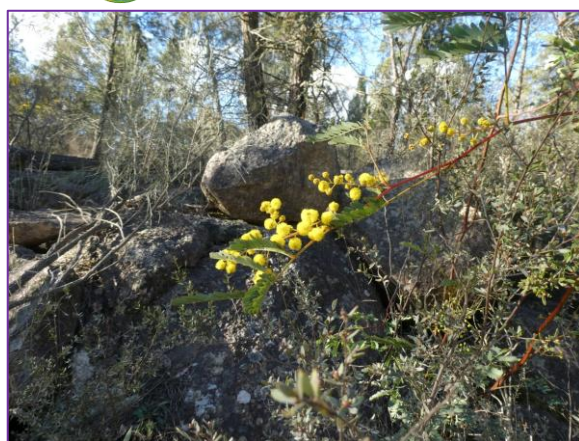
Above: Acacia Pruinosa Left: Hovea linearis Below L.: Acacia venulosa Below middle: Lichen Below Right: Lichen fruiting body All on Twin House Road