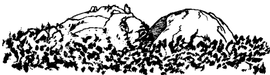
The Pyramids, Girraween National Park

Meetings: 3 rd Wednesday of each month at Uniting Church, Small Hall, 113 High Street Stanthorpe at 7.30pm