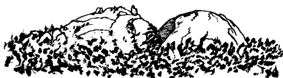
The Pyramids, Girraween National Park

Meetings: 3 rd Wednesday of each month at Uniting Church, Small Hall, 113 High Street Stanthorpe at 7.30pm