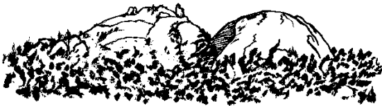
The Pyramids, Girraween National Park

Meetings: 3 rd Wednesday of each month at Uniting Church, Small Hall, 113 High Street Stanthorpe at 7.30pm