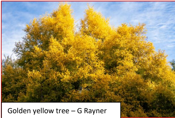
Golden yellow tree – G Rayner