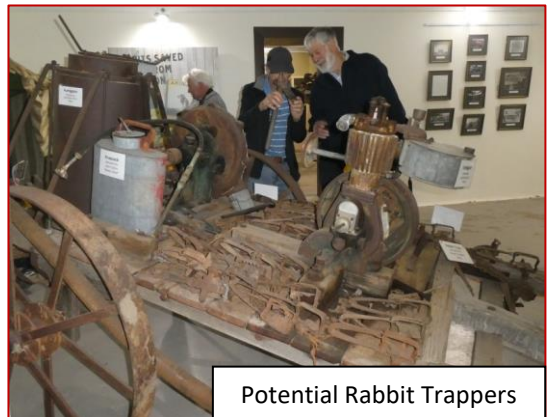
Potential Rabbit Trappers