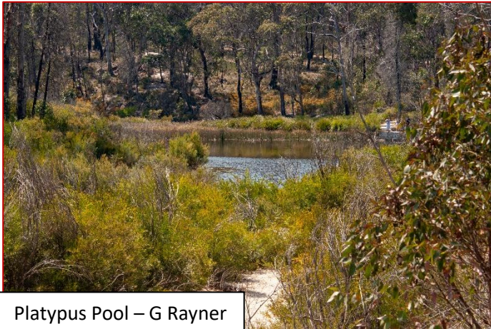
Platypus Pool

Altogether 20 members met for the Platy Project Survey at Boonoo Boonoo National Park, NSW.