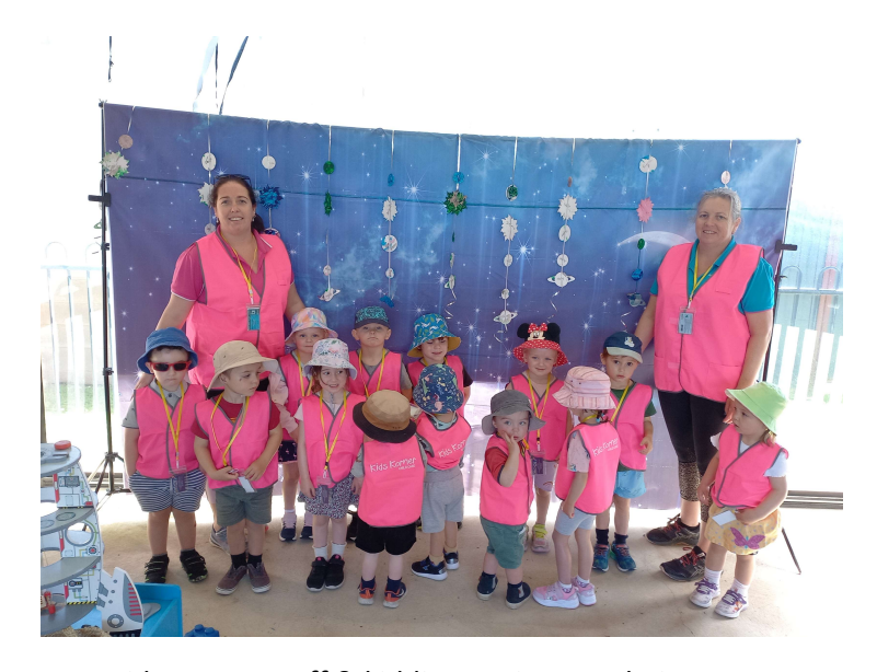
Kids Korner staff & kiddies testing out their new excursion vests & lanyards.